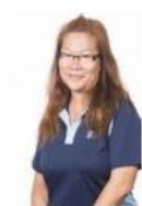
Ling-Jere Senior Amah Primary / Secondary