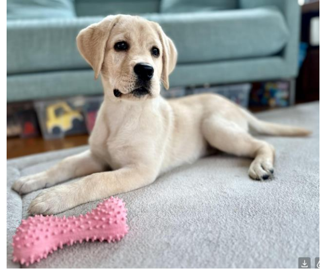
Bonnie School Therapy Dog