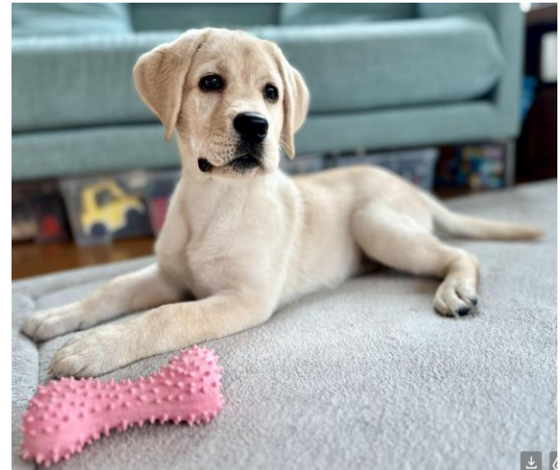
Bonnie School Therapy Dog