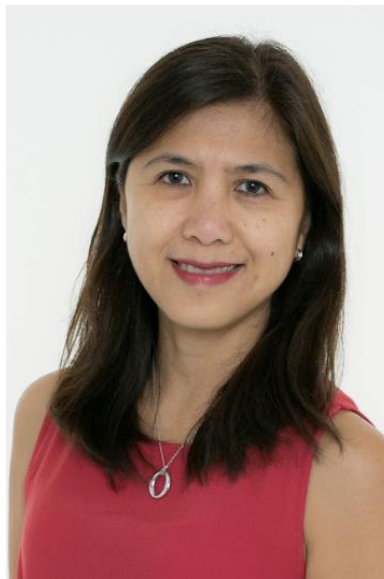
Lolita Tupas Primary Library EA